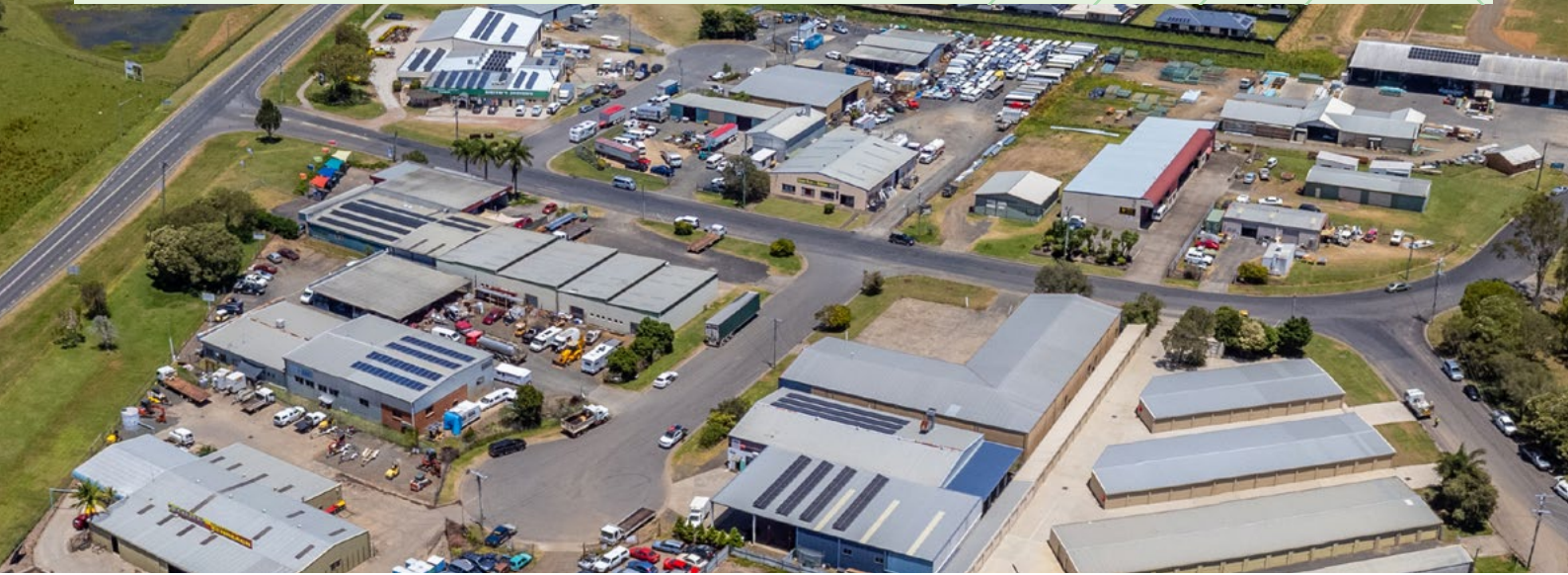
Aerial view of Casino industrial site.