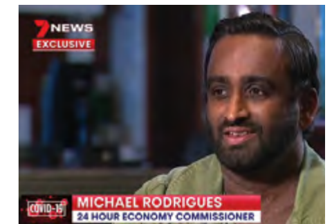
Channel 7 - Good Going Out Behaviour