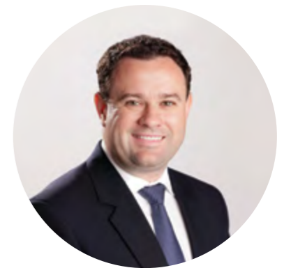
The Hon. Stuart Ayres MP Minister for Enterprise, Investment and Trade, Minister for Tourism and Sport, and Minister for Western Sydney

This Year in Review captures some highlights from a year of disruption. As we move towards greater normality, I am enthused and excited about what great things we can do over the next twelve months.