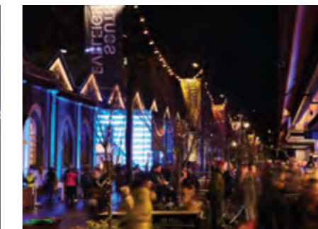
Time Out - Ask the Night Mayor Read Article