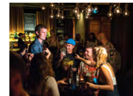
The Daily Telegraph - Hunt on to find Sydney's own Soho district Read Article