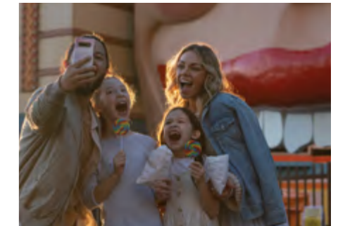
SMH - Sydney's night mayor: 'My job is to get people out of the house and having fun. And often.' Read Article