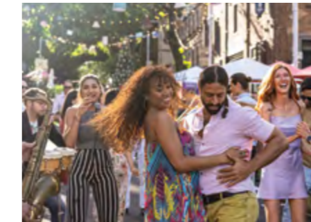
The Sun-Herald - "Justice League" Read Article